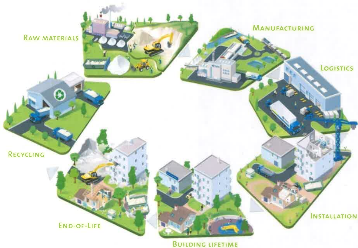
Flow diagram of the Life Cycle